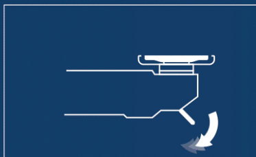
Open the lock