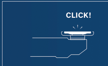
Press until click